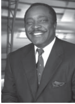
Joe Morgan 1990 Baseball Hall of Fame Inductee 2nd Baseman, Cincinnati Reds 1972-1979 ESPN Lead Baseball Broadcast Team Announcer

People often ask me, "What was the key to your success as a long time member of the Cincinnati Reds?" Certainly commitment, focus and hard work are all part of the equation. However, there are a lot more factors that helped me as an individual ball player and our team as a whole, achieve success.